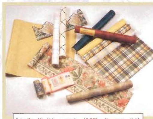
Color Your World has more than 18,000 wallpapers available

"Home decorators can incorporate wallpaper into any vision they have for a room or a space," says Mullett. "Innovation and creativity in the development of papers today make it an ideal resource for any design idea."