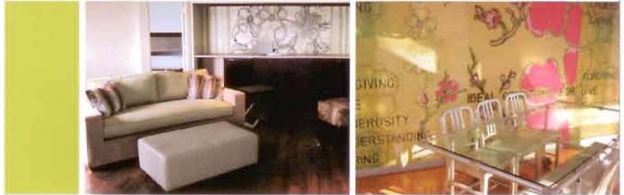
Boy Dirt Candy wallcovering pattern from Grenville Design

A few examples of rooms decorated with some of Grenville Design's wallcoverings, including the Taboo Resort in Muskoka