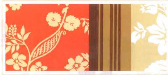
The Wimborne Papers and Tented Stripes wallpaper patterns from Farrow & Ball